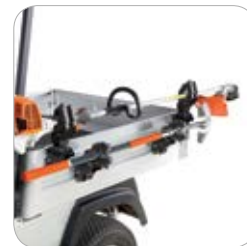
Ratcheting Tool Holder Kit (Upper) & Standard Tool Holder Kit (Lower)