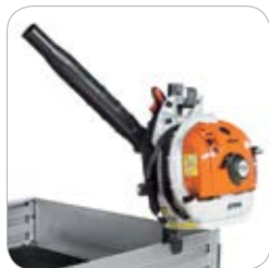
Backpack Blower Rack