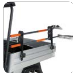
Multi-Tool Holder Kit