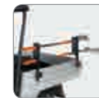
Multi-Tool Holder Kit