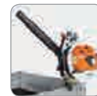
Backpack Blower Rack