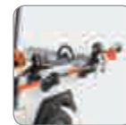
Upper & Lower Tool Holder Kit